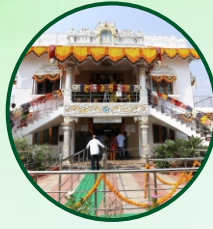
SAI BABA TEMPLE